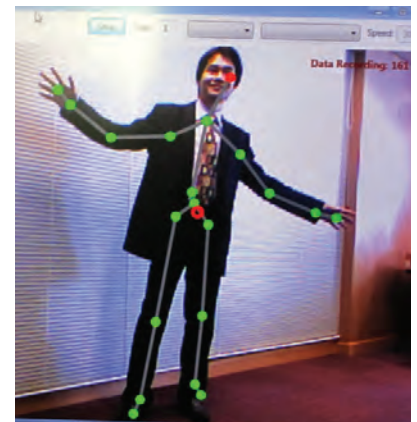
KineLabs makes use of the motion-sensing device built by Microsoft for the Xbox 360 video game console to track users' body segments positions and orientations in three dimensions