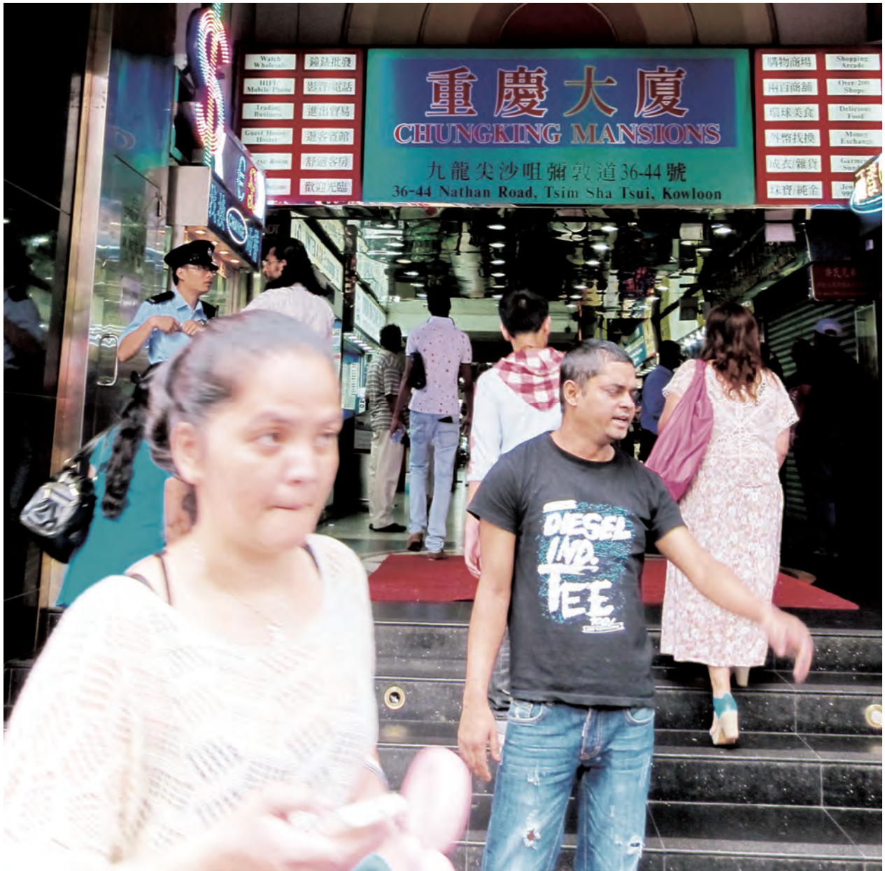
ChungKing Mansion, a popular backpacker's spot, is where most of Hong Kong's refugee reside