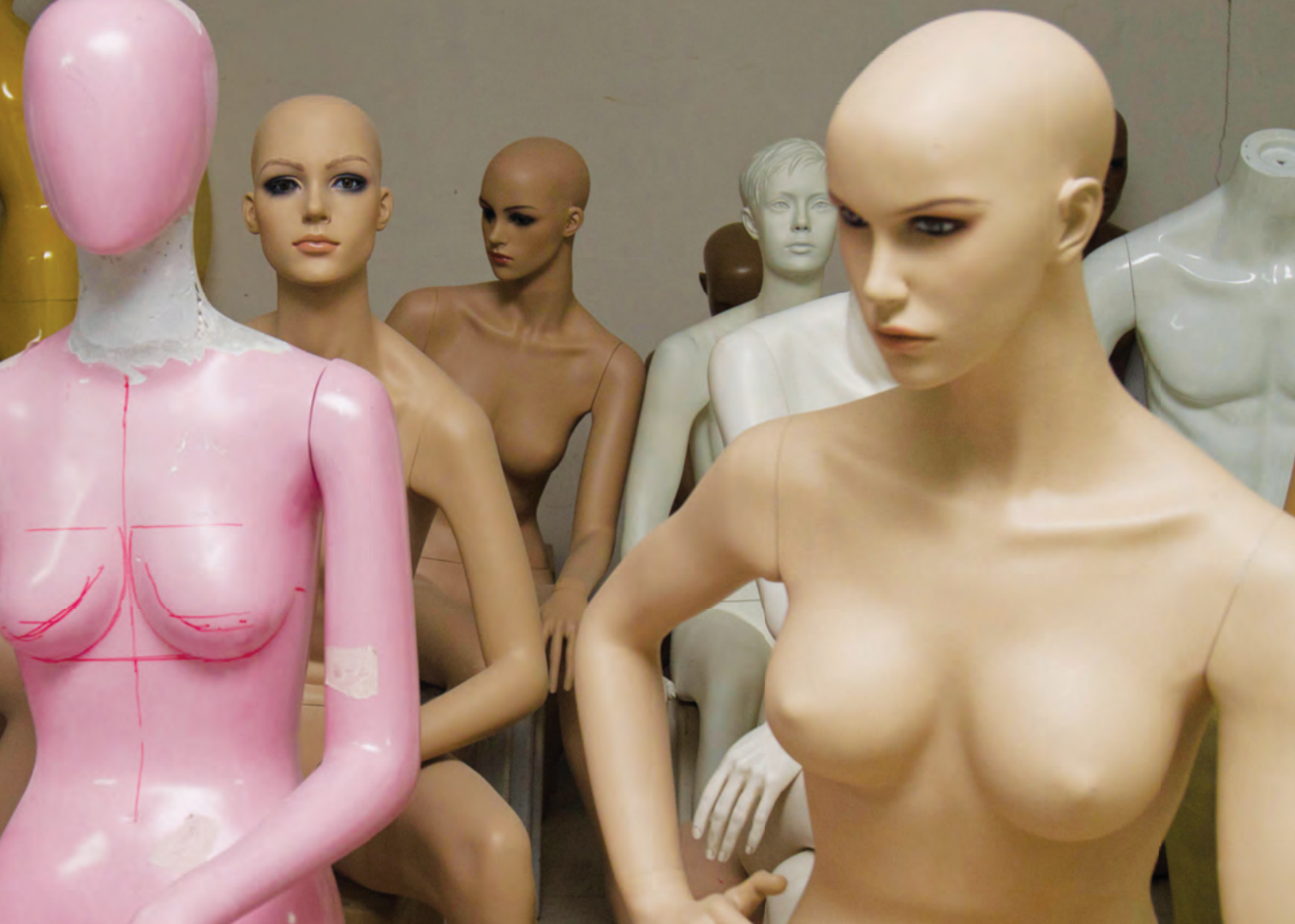
Mannequins in Guangzhou Panyu Kariyo Mannequin Co., LTD