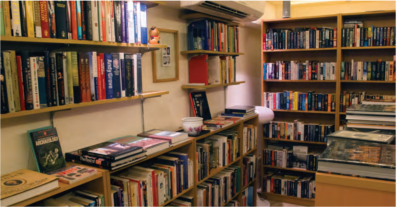
A local second-hand bookshop "The Book Attic", which looks no different from other bookshops, is struggling to survive