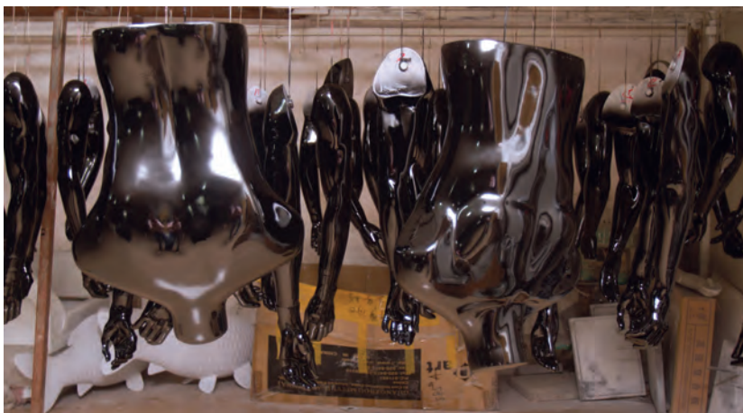
Different parts of a mannequin are to be hand-assembled by workers

The copyrights of mannequins are also well protected. If the pictures are provided by the consumer, the manufacturer is not allowed to sell the mannequins made after the pictures to other consumers, Yang said.