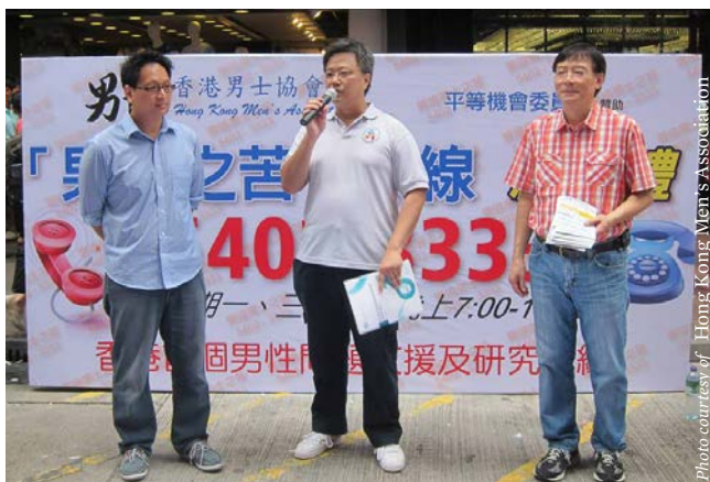
Hong Kong Men's Association runs a helpline for men experiencing domestic violence with subsidies from the government.

Most men in Hong Kong feel ashamed of speaking out against spousal abuse