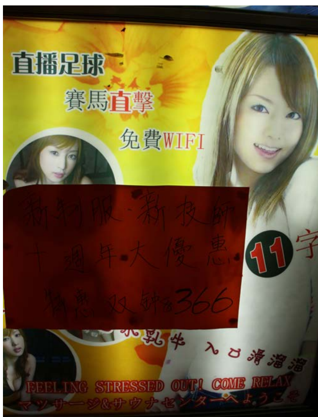
Patrons can watch football games and horse racing news and enjoy free Wi-Fi at some brothels.