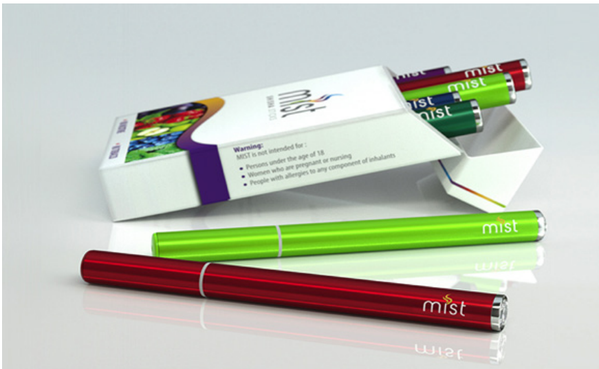
The world spent US$2 billion (about $16 billion) on e-cigarette products in 2011.

Overseas electronic-cigarette makers encounter barriers to entry in China, where their products are made