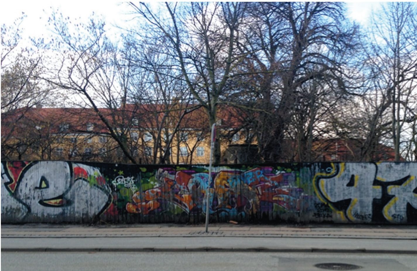
Enclosed by graffiti-ed redbrick walls, the Freetown of Christiania has become a safe haven for hipsters and drug sales.

A chat with the longest resident in Christiania provides a glimpse of life in Denmark's self-proclaimed autonomous neighbourhood known as a safe haven for hippies and drug peddlers