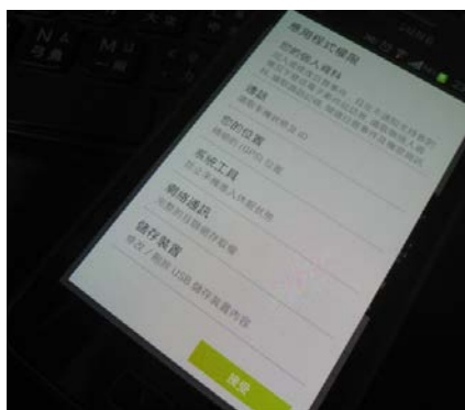
Smartphone users are advised to read through the privacy policy of smartphone applications before agreeing to share your personal data.

Information technology professionals have also expressed concern about the inadequate government oversight of the use of residents' personal data by app developers and corporations in the city.