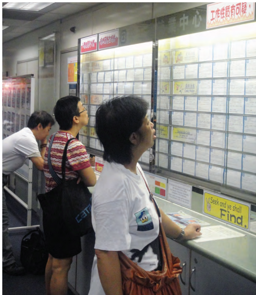
Job seekers should pay attention to the terms and conditions while signing contracts with their potential employers.