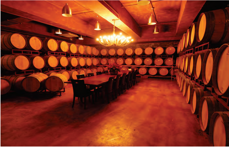
The barrel room in the 8th Estate Winery.