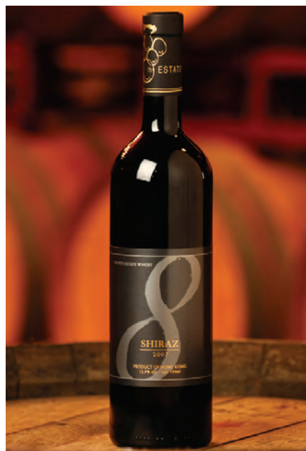
Shariz 2007, product of Hong Kong.

"Wine has become a daily beverage in Hong Kong and it is great to be able to show the process and art that goes into making a great glass of wine," Tusasr added, "the market is really blooming here and the