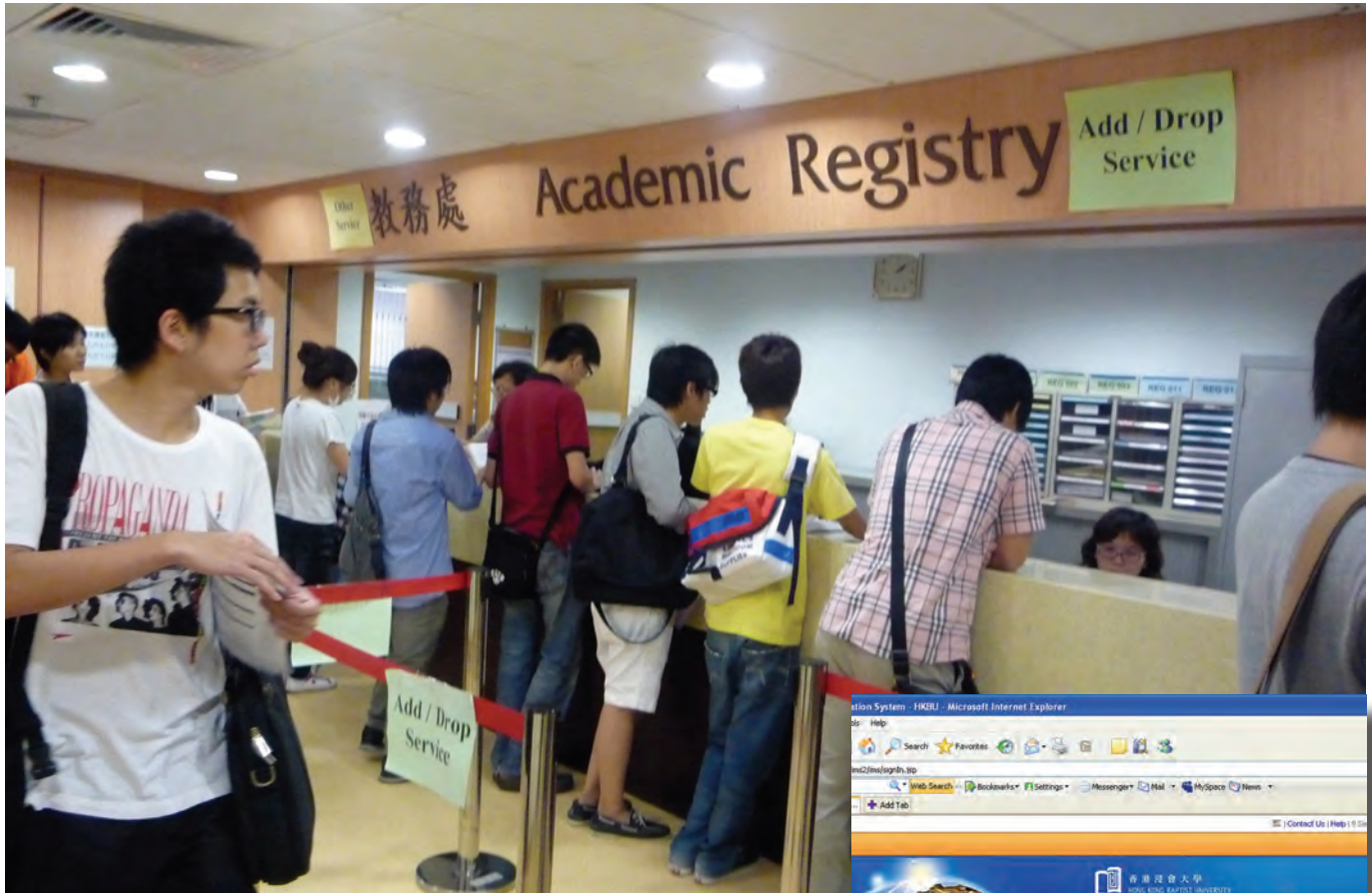
(Above) Some HKBU students seek personal assistance from Academic Registry as online subject registration system fails to work. (Right) The log-in page of the University Information System of HKBU.