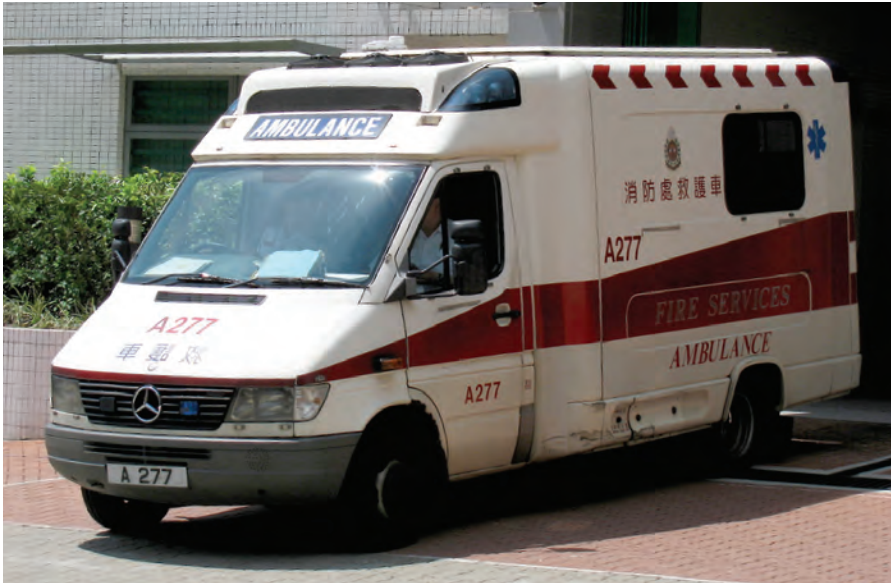
Emergency ambulance calls will be prioritised under the new system.