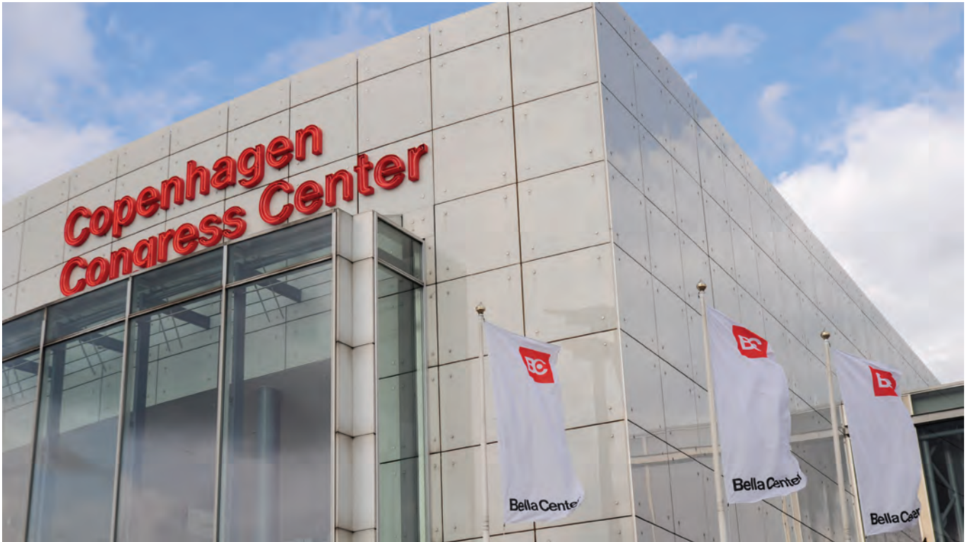
UN climate forum will be held in the Bella Centre in Copenhagen.