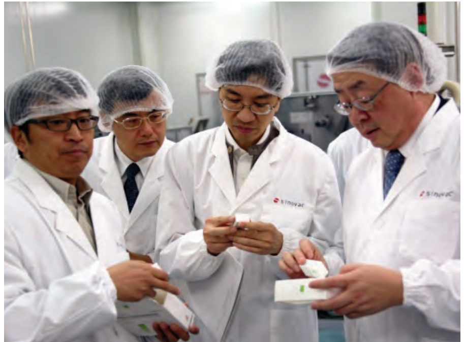
The delegation from Hong Kong visited the production line of Sinovac Biotech.

Asked whether PANFLU.1 would be imported to Hong Kong, the spokesman for the Department of Health replied, "The tender