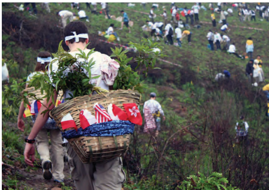
Participants of the Tree Planting Challenge plant seedlings weighing eight kg during the ten km journey.

"Although the government has announcements, people still have low awareness of hill fires when they are commemorating ancestors at their graves," she said.