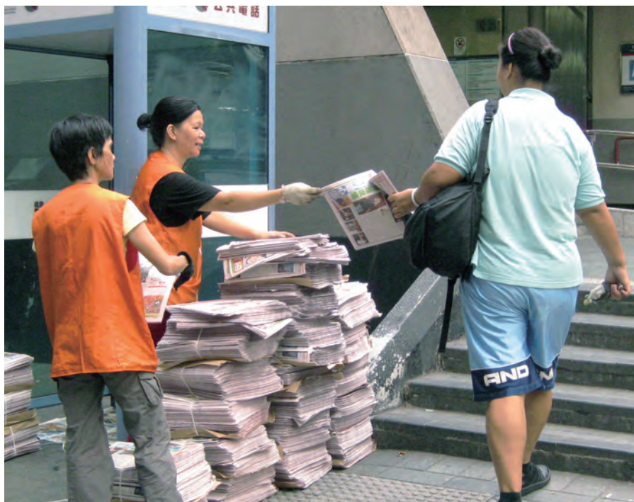
People can get free newspaper easily on the street during mornings.

Apple Daily has once launched hyperlocal news website HomeBloc in 2008 which aggregates information on district levels (covered by The Young Reporter in issue 3 of Vol 41). But it closed down after running for months.