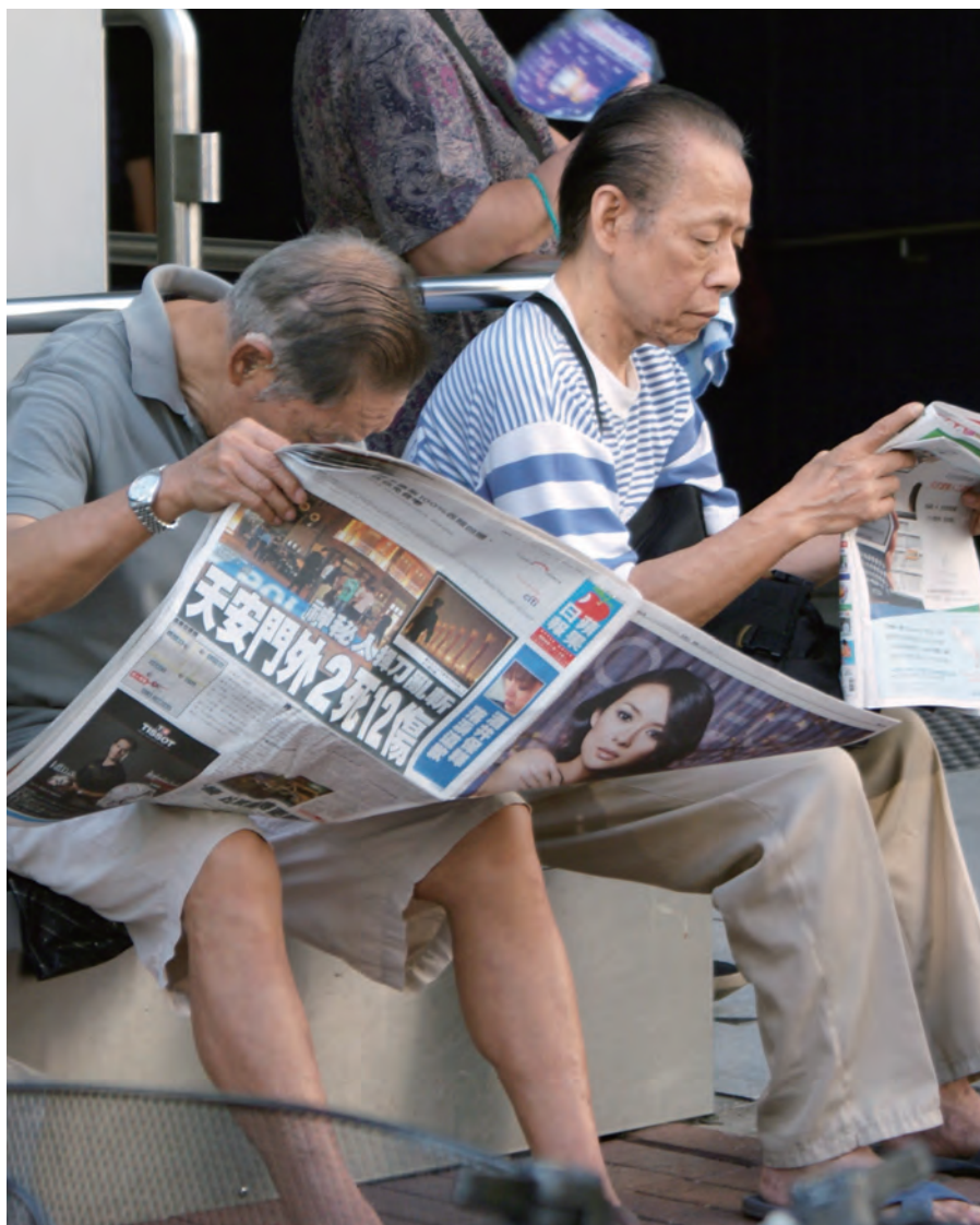
Some people still prefer reading newspaper printed on paper. Putting news online would further widen the "information gap".

Dr Cheung pointed out that visual aids, which includes the unlimited room for images and video clips, are a big attraction of